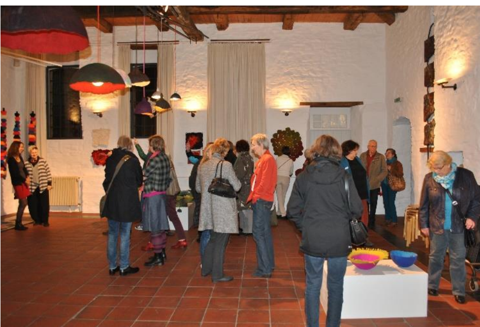
Picture: Exhibition "Interiors" of the Finnish Felt Association Fillti

The Tuchmacher Museum developed a framework program to the exhibitions, ranging from academic lectures, concerts, readings, theatre performances to museum educational workshops. In addition, the museum organizes workshops and days of activity, including an active participation in the International Museum Day and the day of the open monument.