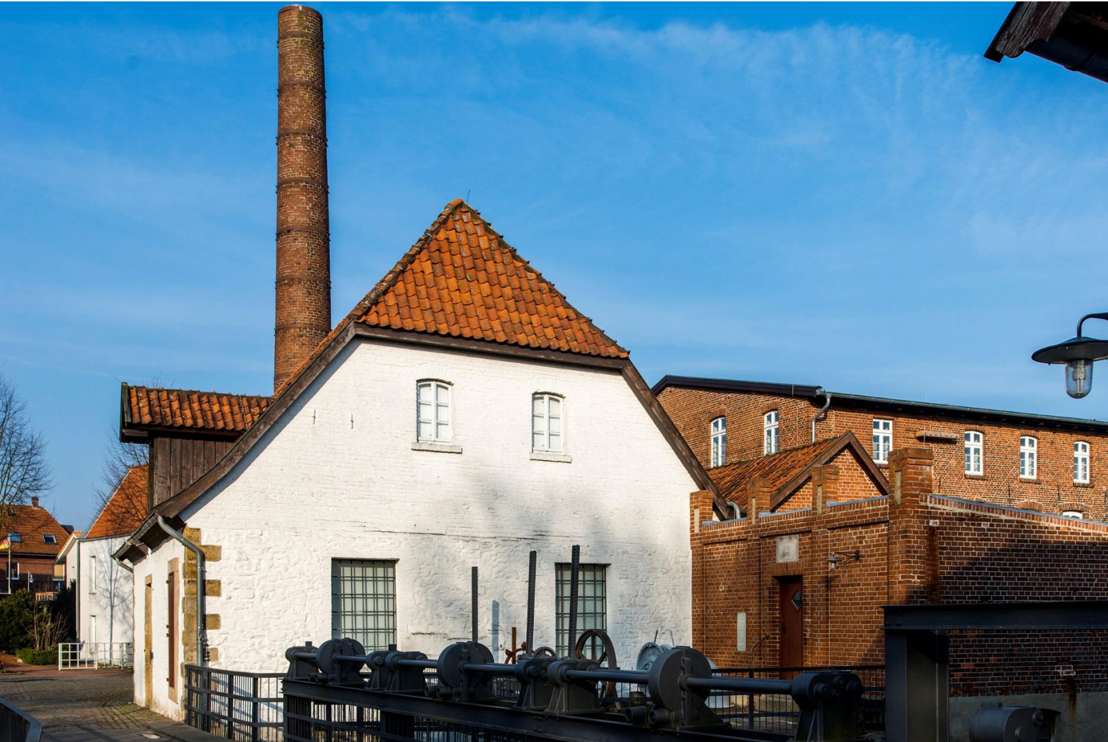
Picture: Exterior view of the museum buildings